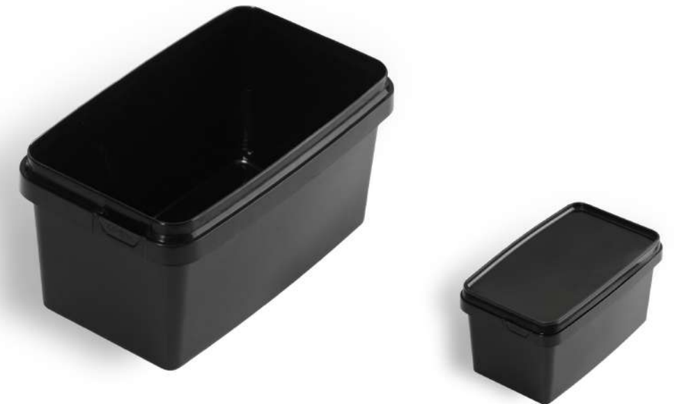
1100 ML Rectangular Food Packaging