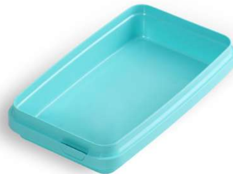
330 ML Rectangular Food Packaging

At Monopol Plastik, we offer packaging solutions specifically for the food industry, compliant with high-quality and hygiene standards. Our products are manufactured to be freezer-safe, suitable for cold and hot filling, and feature leak-proof foil sealing. Designed with various color and transparent options, our packaging allows you to store your food products both safely and aesthetically.