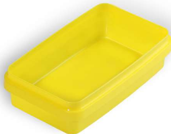
550 ML Rectangular Food Packaging