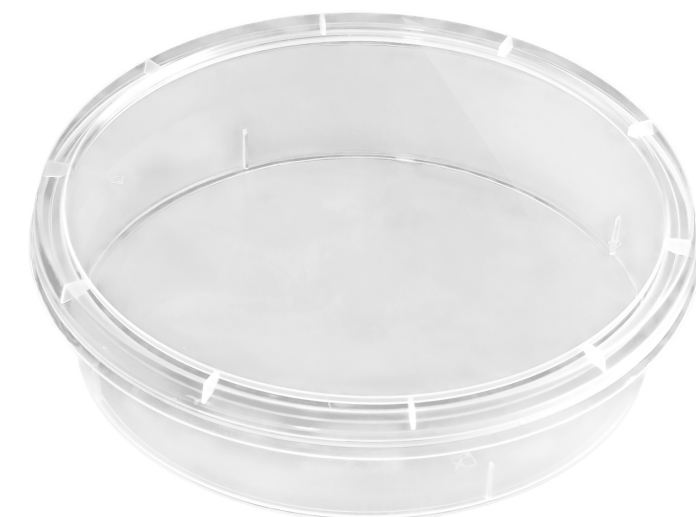
1100 ML Round, Foil Sealable Food Packaging